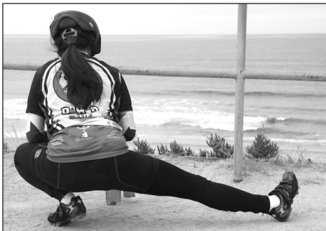
Stretch before and after riding to prevent injury—several stretching groups are held each day.